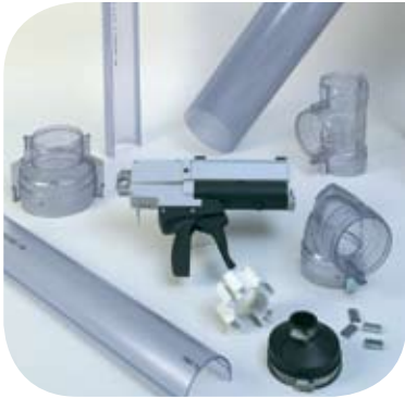
Contain-It™ products and accessories.

The technical data given in this publication are for informational purposes only. They imply no warranty of any kind. Please consult our General Conditions of Supply.